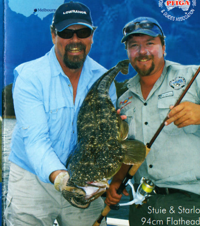
Stuie & Starlo 94cm Flathead